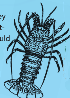
Seawater red crayfish