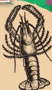
Fresh water crayfish 'crawlie'

Next month Uncle Maui will take Torrance and Cooper fishing for flounder or flat fish. What is the Maori name for flounder? Where are their eyes?